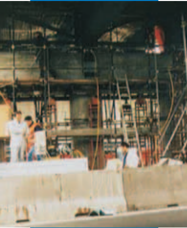
A view of the bridge during reparation work