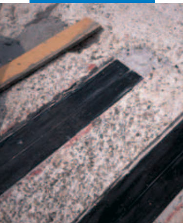
Fixing Carboplate in especially created areas on the substrate