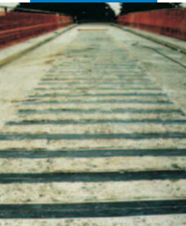
A bridge-deck reinforced with Carboplate