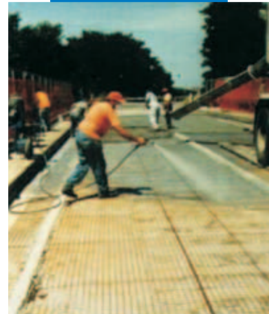
Applying the epoxy primer