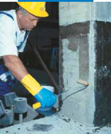
Applying a coat of MapeWrap Primer 1