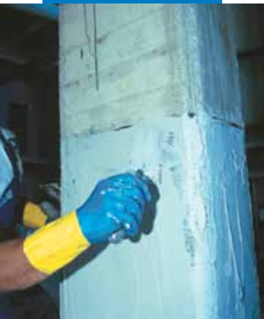
Levelling with MapeWrap 11 or MapeWrap 12