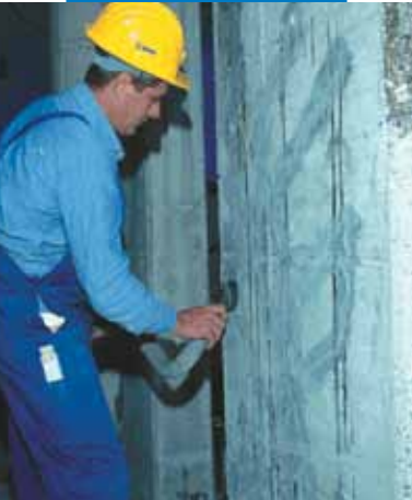
Preparing the substrate